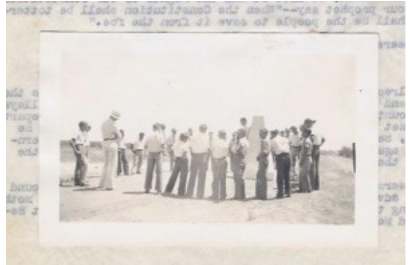
Unveiling of the Mormon Pioneer Monument

Nestled in the northern border of Mesa near the 202 Freeway and Gilbert road, the Landing at Lehi Falls will utilize a half-mile stretch of Mesa's historic canals and surrounding plots of land to create a truly unique public space.